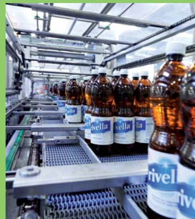
As part of the conversion of the Innopack Kisters SP, the existing controller was replaced by a new controller (Siemens S7) and the previous analog drives were replaced by digital drive equipment.