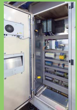
The switchboard and the operator panel were completely replaced as part of the conversion.

erage, every Swiss therefore drinks about 10 liters of Rivella per year, and at the same time internalizes a Rivella mission which says „Our beverages represent refreshing moments, active zest for life and Swiss originality - day by day.“