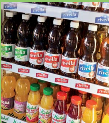
Rivella is the clear Number Two soft drinks brand in Switzerland. Here, approximately 78 million liters of Rivella brand beverages are consumed each year.

All in all, Rivella AG's annual beverage production amounts to approximately 105 million liters. Of this, about 80 % remains within Switzerland and 20 % is exported. The main export market continues to be the Netherlands. Rivella has had a major presence here since 1957. An interesting fact is that Rivella Blau is the most popular in the Netherlands. This is probably as a result of the Netherlands being the original market for Rivella Blau, as the light beverage was marketed here in 1958 and therefore a full year before being introduced in Switzerland.