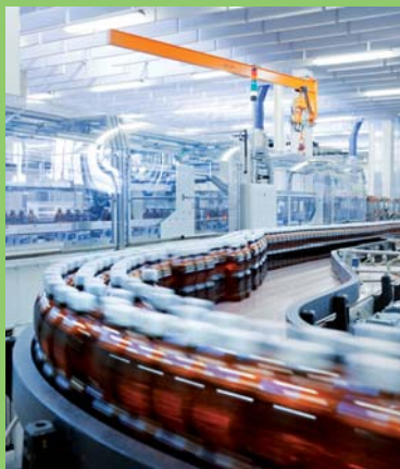
In the „Rivella PET line“, an Innopack Kisters SP dating from the year 2000 packages the filled PET bottles in shrink packs. It has recently been upgraded by KHS, as a result of which the supply of spare parts is guaranteed for the next 10 years.