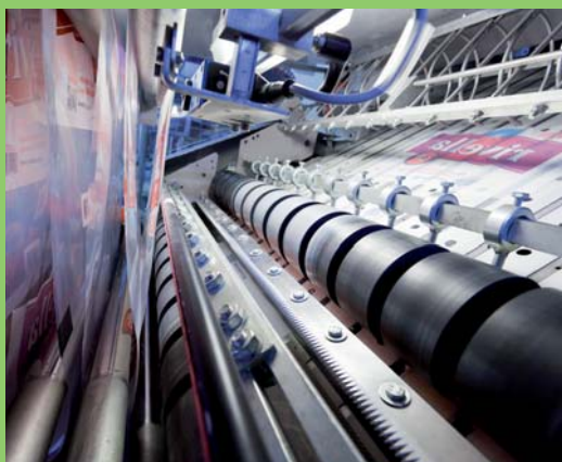
Also included in the conversion package was the provision of the film cutter with a separate servo drive which operates independently from the main drive. This is accompanied by even more accurate film cutting and less wear of the film cutter.

As part of the conversion, the existing controller was replaced by a new controller (Siemens S7). As this new controller is only suitable for digital drive equipment, the incorporation of the new controller had to be accompanied by replacement of the previous analog drives with digital drives. Also included in the „conversion package“ was the provision of the film cutter with a separate servo drive which operates independently from the main drive. The standard practice to date had been to drive the film cutter from the main motor via a coupling. The main advantage of converting to a servo-motor-driven film cutter is more accurate cutting and lower wear of the