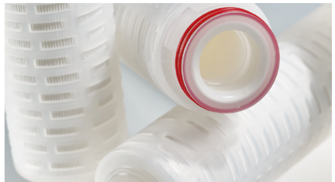
BECO MEMBRAN PS Pure™ membrane filter cartridges safely retain spore-forming bacteria, which can harm fruit juice, using an asymmetric pore structure with an LRV (log reduction value) of more than 7 per cm².